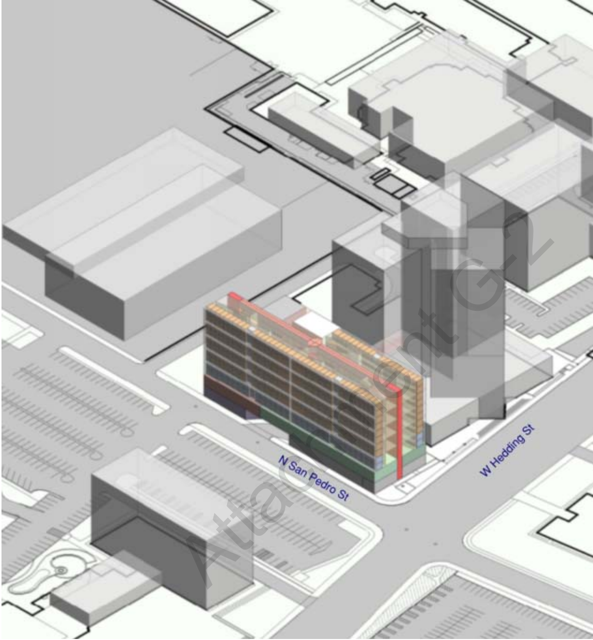
Figure 1 Before scope change location (Main Jail East)